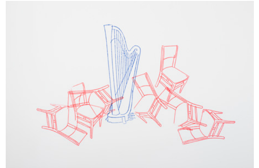
TOP: Clare Cooper Wreck (Auckland) 2015 stamped ink on paper 59.4 x 42 cm

Clare Cooper has been an active member of the Australian arts community since she co-founded in 2001 the NOW, now festival of spontaneous music & experimental film. Her current projects explore context, futuring and speculative design applied to performance, composition, creative community organising, improvisation, graphic scores, filmic portraiture and general survival.