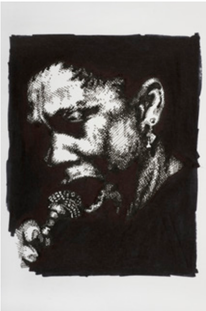
BELOW: Clinton Walker Deadly Woman Blue series Connie Mitchell (pop-EDM singer, b.1976, from South Africa) 2012–2014 ink on paper 28.5 x 21 cm