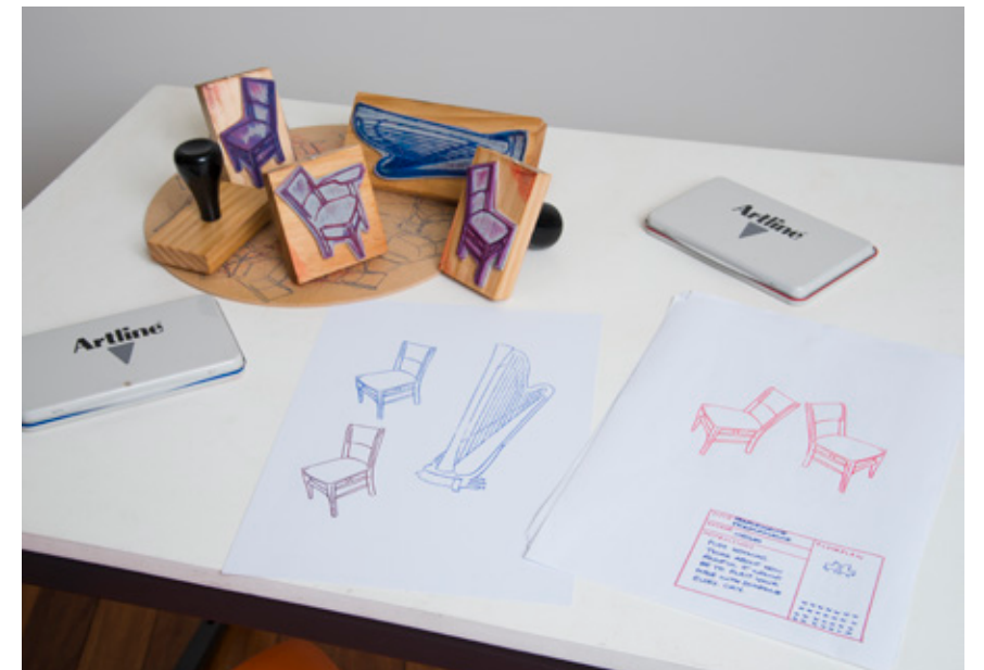
BOTTOM: Mapping Scores wall drawing 2015 Performance based scores Interactive wall drawings using stamps